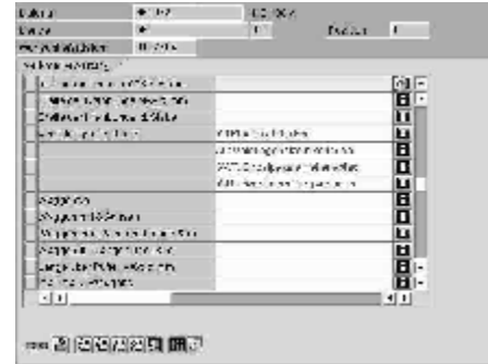
Illustration 2: Example of Puzzle planning software